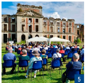
3. The former presbytery / 4. La Maison Saint-Simon / 5. The Book Festival